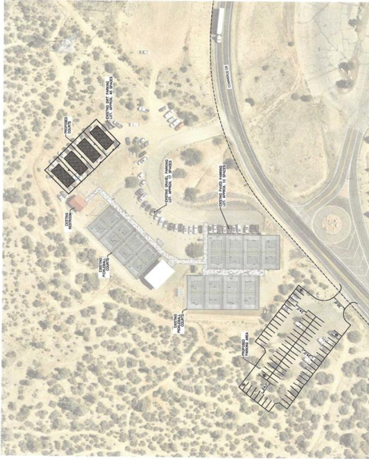
PROPOSED PICKLEBALL COURTS